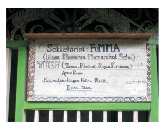
Figure 1: FOMMA Secretariat in the village of Data Dian District Kayan Hilir