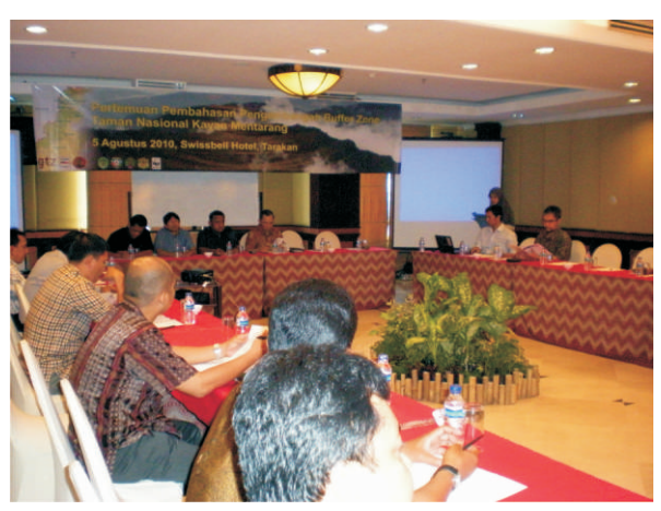
Figure 4: Discussion with the master plan bufferzone in Tarakan.