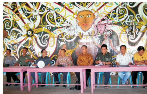
Figure 2: Deliberation indigenous territories FoMMA in the village of Long Nawang in the framework of coordination and aspirations.

- Customary councils (customary land areas/communities/community laws) on which FoMMA is based: FoMMA represents all customary people in and around the KMNP.