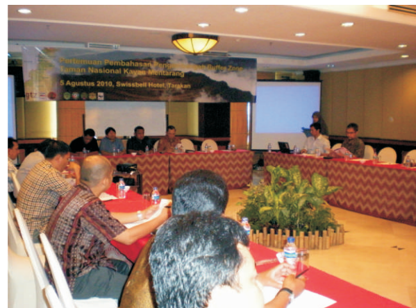
Figure 4: Discussion with the master plan bufferzone in Tarakan.