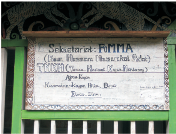
Figure 1: FOMMA Secretariat in the village of Data Dian District Kayan Hilir

and use of natural resources in each customary land area.