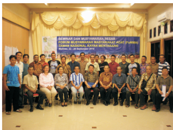
Figure 5: Seminars and great deliberation FoMMA in Malinau

Jln. Raja Pandhita No. 89 RT. 07 Tj. Belimbing, Malinau Kota Kalimantan Timur - 77554 Telp : 0553 - 215 23 Email: drukman@wwf.or.id